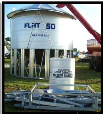
FLAT 50 - 50 tonne Mobile Silo Hydraulic Wheel Lift With Butterfly Lid (Pictured)